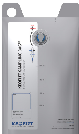
Keofitt Sampling Bag™ 1000ml.

Intended for collecting and storing any samples for microbiological and chemical/physical analysis, it is an ideal solution for food/dairy/beverage/brewing applications.