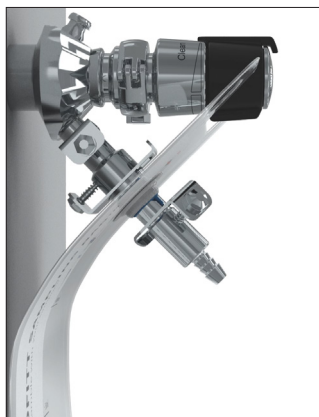
Fig. 1 Connect