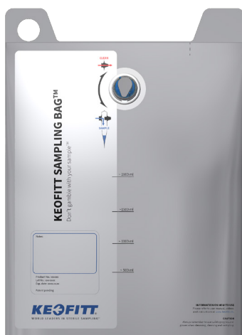
Keofitt Sampling Bag™ 2000ml.

The Keofitt Sampling Bag™ is available in two different sizes: 1000ml and 2000ml.